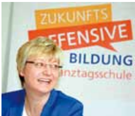
Frauke Heiligenstadt Lower Saxony Minister of Education

You will find this a valuable basis for making a well-informed decision about your child's continuing education. The shared aim should be that your child is happy and keen to rise to the challenges of the type of education chosen.